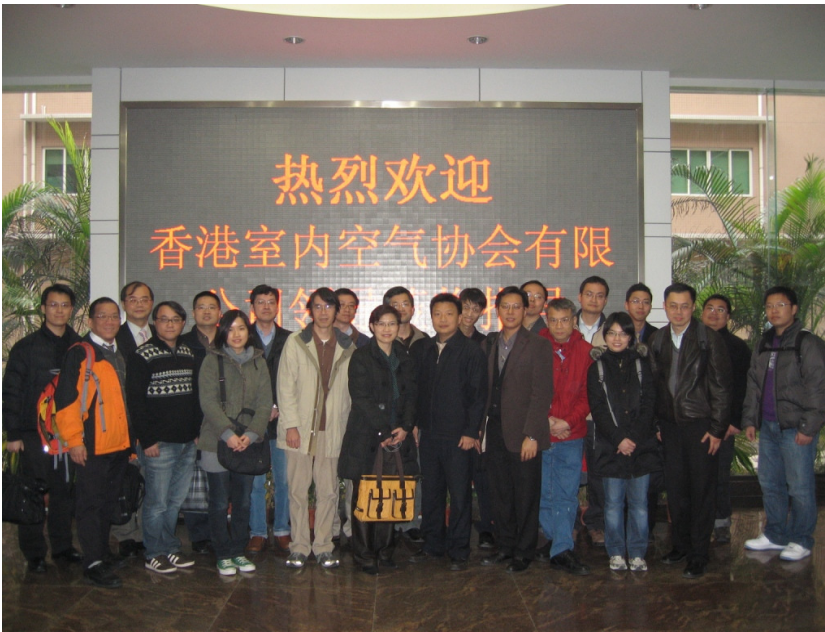
Photo of delegation taken in the SCM

Hong Kong Indoor Air Quality Association has visited “South China National Centre of Metrology“ (SCM) on Feb 29, 2008. More than twenty visitors of the delegation, including colleagues from our company have participate in this visit. We have more understanding about “The accreditation of calibration service of Indoor air quality monitors“ provided by this center.