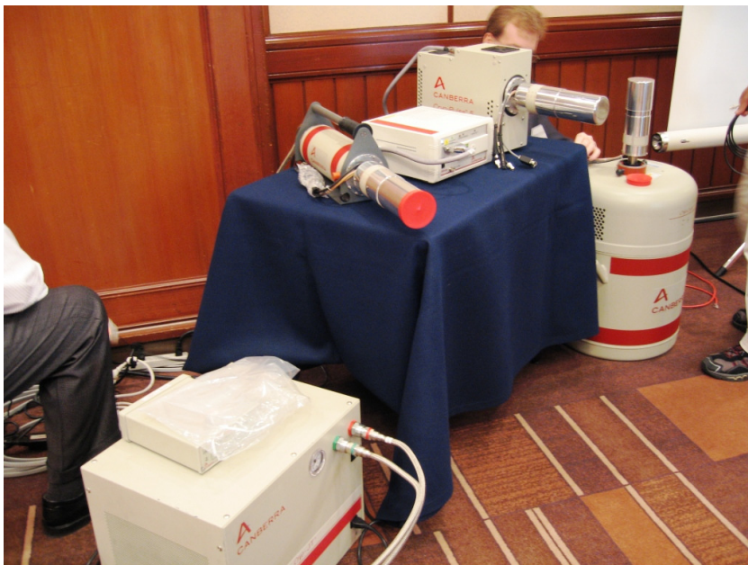
Portable HPGe-Based Nuclear Identifier

In the meeting, Canberra displayed lot of the latest products including Dosimeter, Portable Dose Rate and Survey Meter, Hand-Held Multichannel Analyzer and High purity Ge detector.